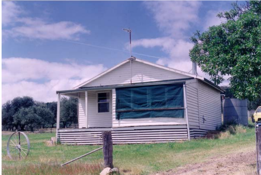
The farm house I lived in at Laharum