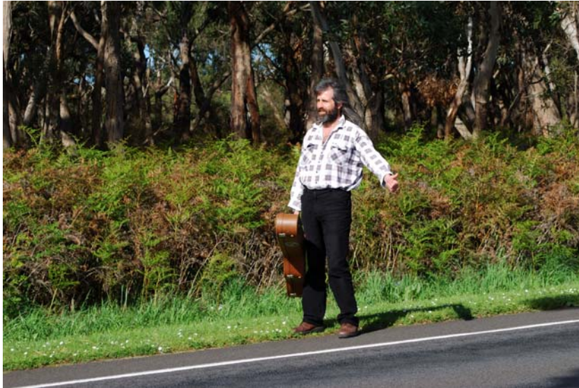
The Musician on his penniless journey

The life of the Artist and Free-Thinker is driven by the restless spirit of the Muse. He can't be tied down to a routine job with a routine home life and a bunch of preset rules. He must be free to act on the call of the muse, not only in music, but in life itself. Of course this means sacrificing many of the things that form the structure of life for most people, such as: money, marriage, children and self-sufficiency. It is a difficult, frustrating and unrewarding life and as such cannot be recommended. Still, if the muse's siren call is an imperative there is no other way.