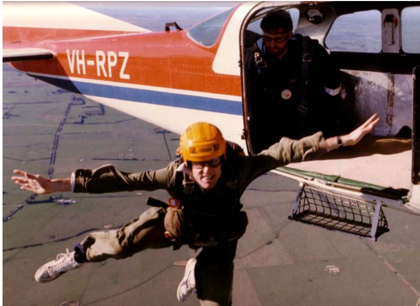
Don't let the shaven appearance fool you, this is me in 1985 at the Pakenham Drop Zone.

In a life on the Dole there is much to get you down, and when you don't suit Society and when your life is cursed, it is easy to see that you have no future and you might then bury yourself deep in the Slough of Despond and seek oblivion. However, I am glad to say that my spirit is better than that, and despite all, I can still do my work and can still find enjoyment and substance in life. And Yes! I still believe I may yet find recognition and success and indeed, in the end, I AM GONNA FLY!