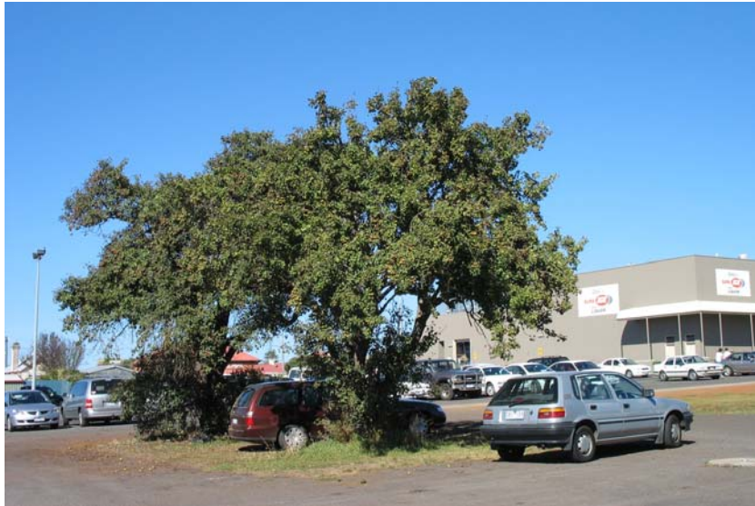
The eponymous peartree