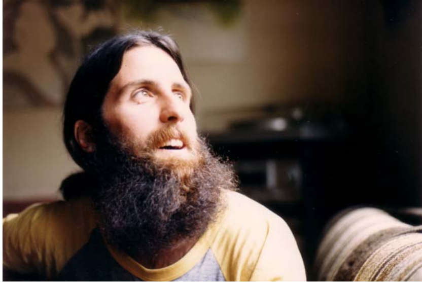
The Artist after his first full year on the dole

The first years on the dole after leaving school and my first taste of full-time employment were very undisciplined: I wandered around physically and mentally, enjoying myself, exploring independent life and following the wild directions of my muse. So absorbed was I in my explorations that I had no interest in the external world. I was exploring philosophy, religion, the occult, psychoactive drugs, motorcycles and electric guitar. The external world after all, was nothing more than a manifestation of the internal.