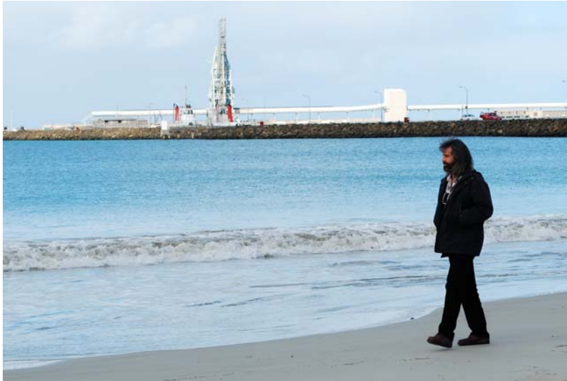
You'll never walk alone? Huh!

It didn't take too long before the problems of choosing such an iconoclastic life made themselves apparent. Friends deserted me, strangers treated me with contempt and life hit rock bottom. It was a painful time but it toughened me up and gave me a new respect for the important things in life: namely friends and family. I have been fortunate to have always had a tolerant and supportive family who certainly helped me when I needed it the most. Friends were less tolerant however and the ones I have made since then I have valued more highly and made a real effort to keep.