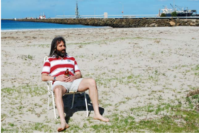
A beer on the sand, any obs?

The good side of life on the Dole is very good as far as I am concerned: You don't need to work! When no one's on your case making you jump through hoops and no one's abusing you for taking their taxes and you've paid your bills, it provides a great sense of freedom that I prize above all else.