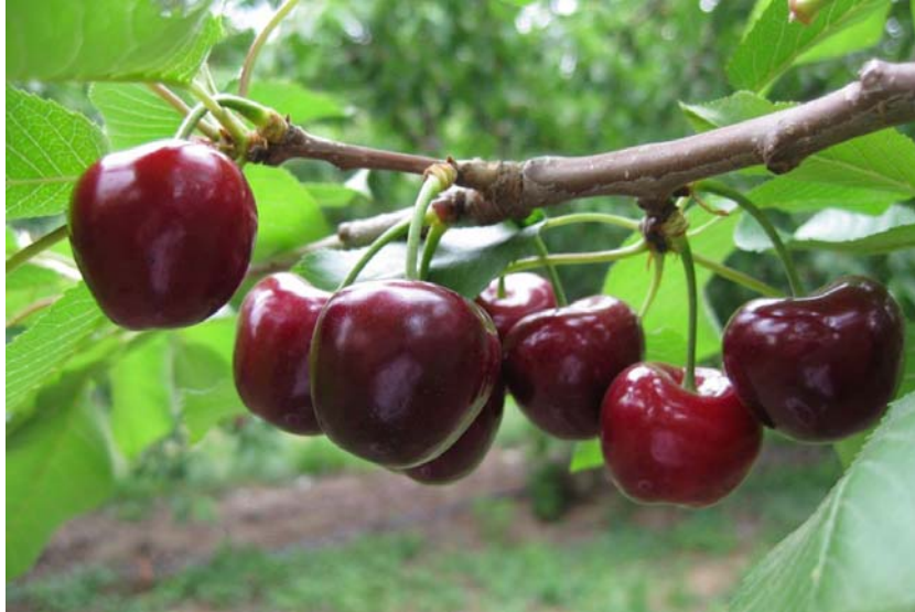
Yep, they're cherries, ripe for the picking. Careful not to take the buds as well...

Of course a life on the Dole is a life of poverty and to buy things I need I have been forced to take work from time to time. Notwithstanding the fact that normal working people don't believe it, one becomes tainted with the smell of the Dole Bludger however and one is unable to obtain work in all but the most undesirable jobs. The only real walk-up start you can get is that of the seasonal fruit picker and reason is that few people are prepared to do it on account of the miserable pay. In my case I picked cherries over several summers at Wandin, and had a fun time with the other itinerant pickers at the workers campground. This song was written and sung at the camp with other pickers at time.