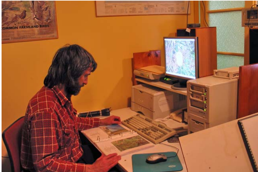
Is this the way out?

Faith in myself is what keeps me going. The belief that my work is first class and that if I persist in creating and packaging it it will eventually provide a path out of this den of iniquity. I see the world as a maze that one's life describes a path through. For me recognition and success lie at the out door. Surely there is a way that by intelligence and persistence alone I can outwit my enemies, overcome my curse and find the subtle pathway through. Time will tell.