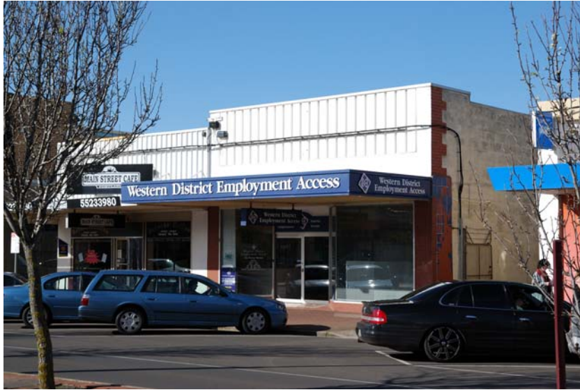
The Unemployed are a political football, here is one place you may be kicked

After 20 years on the Dole I feel eminently qualified to speak on the entire business. This song is my carefully crafted and definitive distillation of all I have been through. Here I not only give a brief summation of the shortcomings of this life and my response to them but also justify my taking of the government's hand out over all these years. The Artist and Free Thinker is an essential part of society, unfortunately the inhuman idiocy of economic rationalism leaves him nowhere to stand. I demand the right of the Artist to exist and I take my place whether the philistines like it or not!