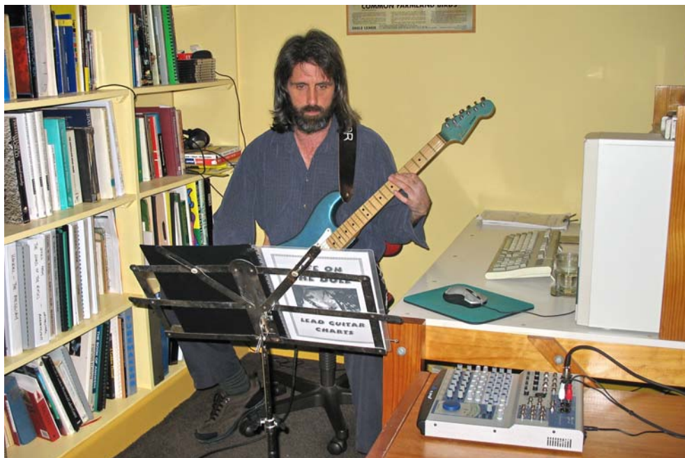
Laying down lead tracks for this album